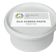
129 MIX WHITE