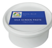
113 ROYAL BLUE